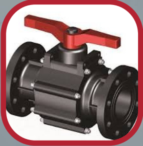
PLASTIC BALL VALVES