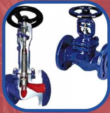
BELLOW SEALED GLOBE VALVES