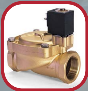
ATEX SOLENOID VALVES